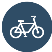
Dockless bike share (including e-bikes)