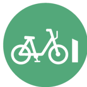
Station-based bike share (including e-bikes)

Shared Micromobility encompasses all shared-use fleets of small, fully or partially human-powered vehicles such as bikes, e-bikes, and e-scooters.